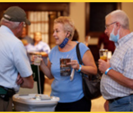
BRASS BUTTON AWARD - September 14, 2021