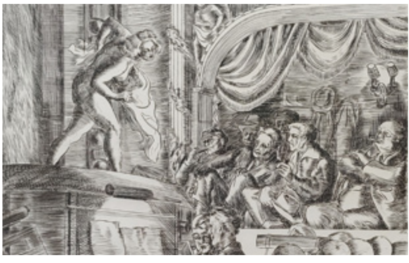
Reginald Marsh, People's Follies, 1938