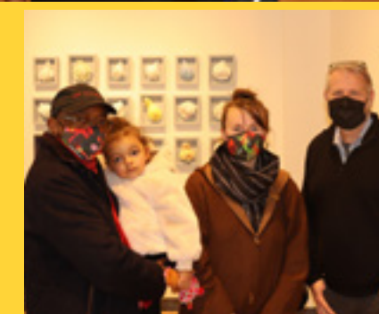
A FACE LIKE MINE RECEPTION - May 2, 2021