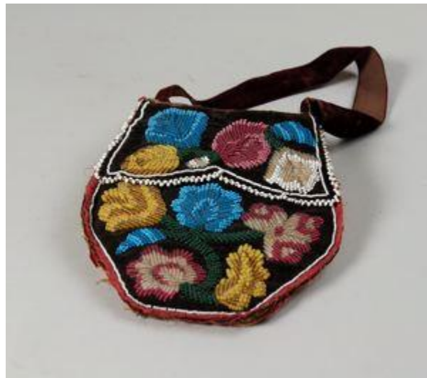
Beaded Pouch. American Indian: Iroquois. 67.29.6.

In this activity, you'll be creating your own beads out of paper or use other found objects to create your own jewelry.