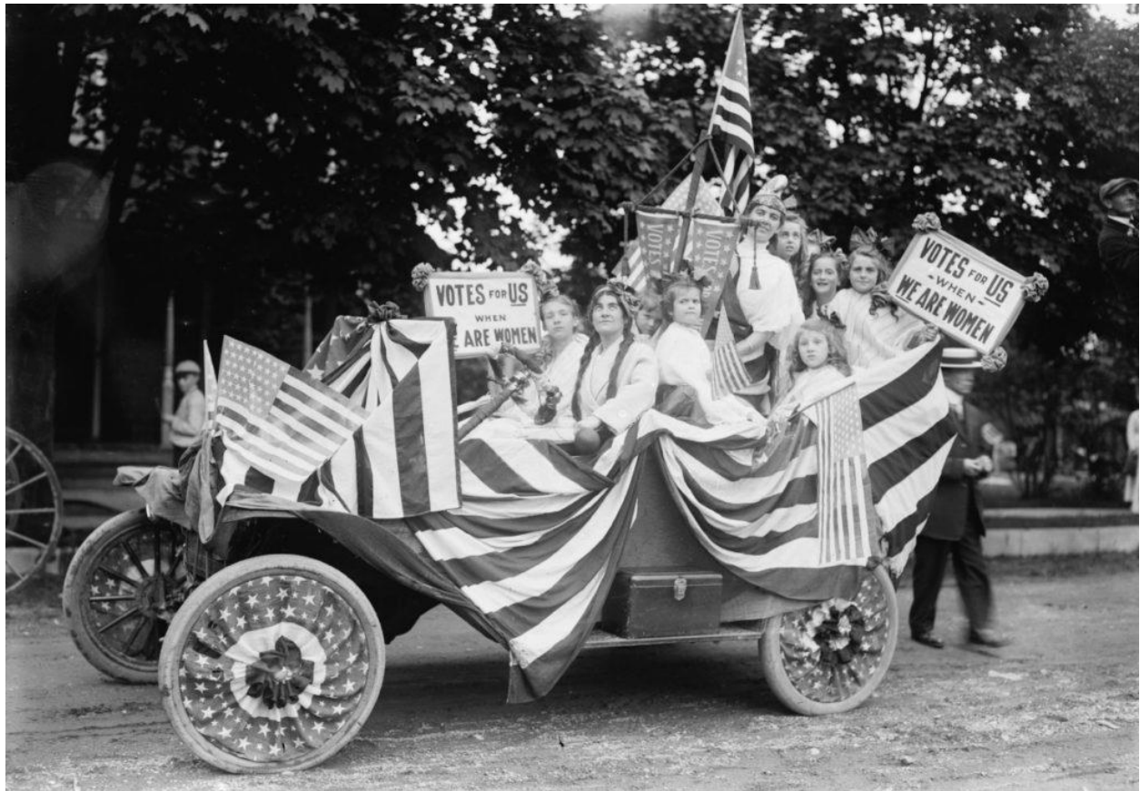
Suffragists in parade, ca. 1910-1915.

What is paraphernalia? It is the group of things that someone needs for a particular activity. In this case, suffragette paraphernalia is the array of objects that suffragettes used to convince people to give women the right to vote. This included banners, sashes, buttons, playing cards, postcards, and other household objects like tea sets, paper cups, and clothespins.